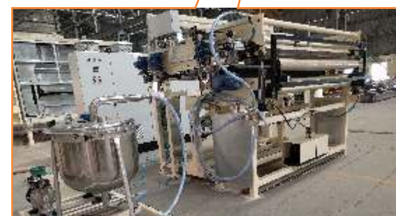
The Gravure Coater